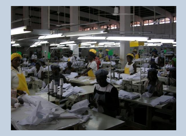
Image 1: Formal (left) and informal (right) establishments in the textile sector.